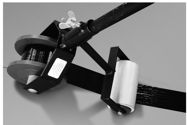
Single-side tape reel - H367 0003